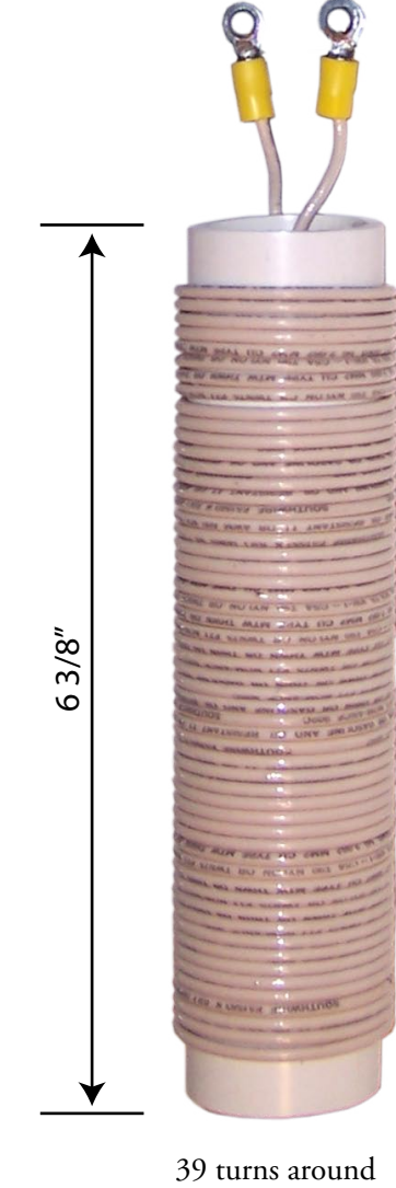
39 turns around 1 1/4" PVC pipe

A rod or stick antenna has smaller side lobes and projects the magnetic field out the ends.