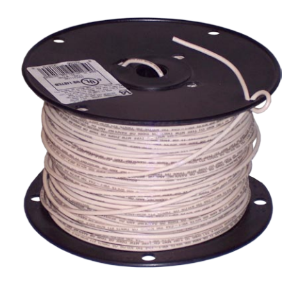
14 AWG stranded wire 19 strands of 27 AWG

An antenna with a narrow field can be made from inexpensive stranded copper wire used in house construction.